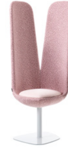
PETALS by Stone Designs