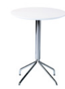
FLEX by Ruud Ekstrand