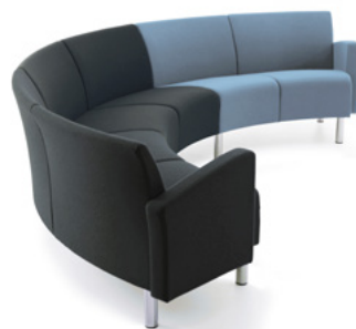
NONSTOP by Ruud Ekstrand