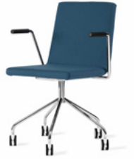
AFTERNOON by Claesson Koivisto Rune