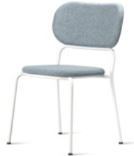
SOFT TOP by Brad Ascalon