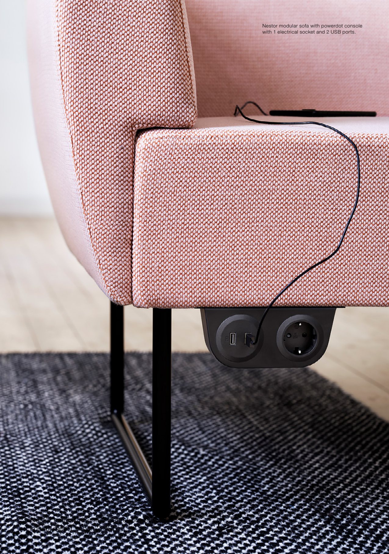
Nestor modular sofa with powerdot console with 1 electrical socket and 2 USB ports.