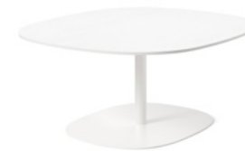
MATSUMOTO by Claesson Koivisto Rune