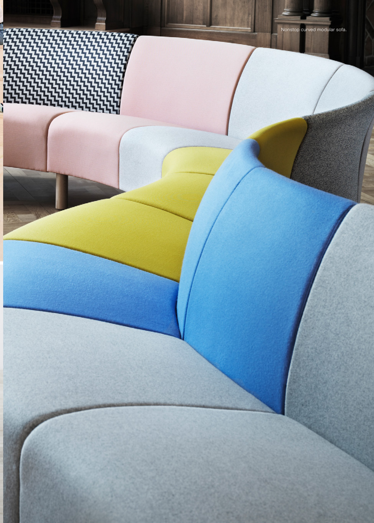
Nonstop curved modular sofa.