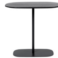
MATSUMOTO by Claesson Koivisto Rune