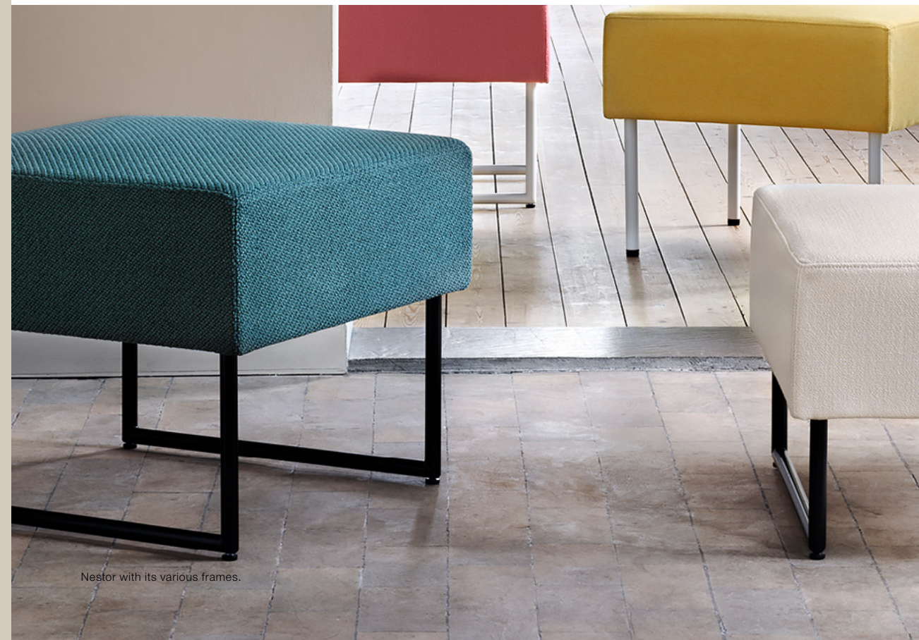
Nestor with its various frames.