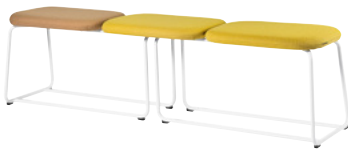
SOFT TOP by Brad Ascalon