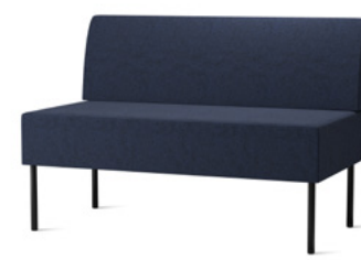
NESTOR