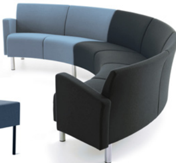
NONSTOP by Ruud Ekstrand