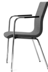
FLEX by Ruud Ekstrand