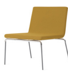
AFTERNOON by Claesson Koivisto Rune