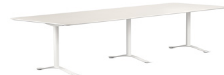
APLOMB by Everything Elevated