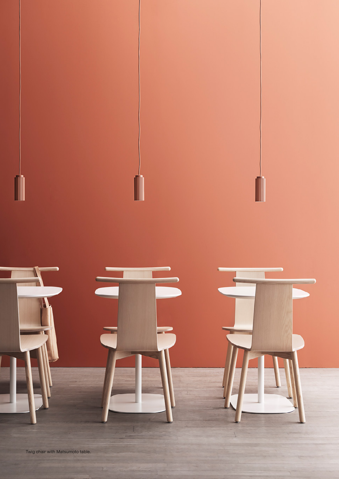
Twig chair with Matsumoto table.