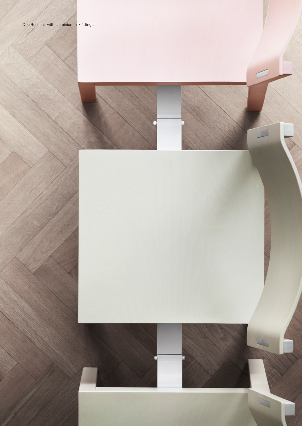
DeciBel chair with aluminium link fittings.