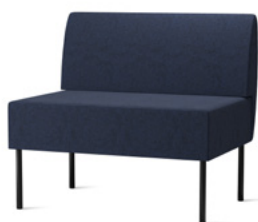
NESTOR