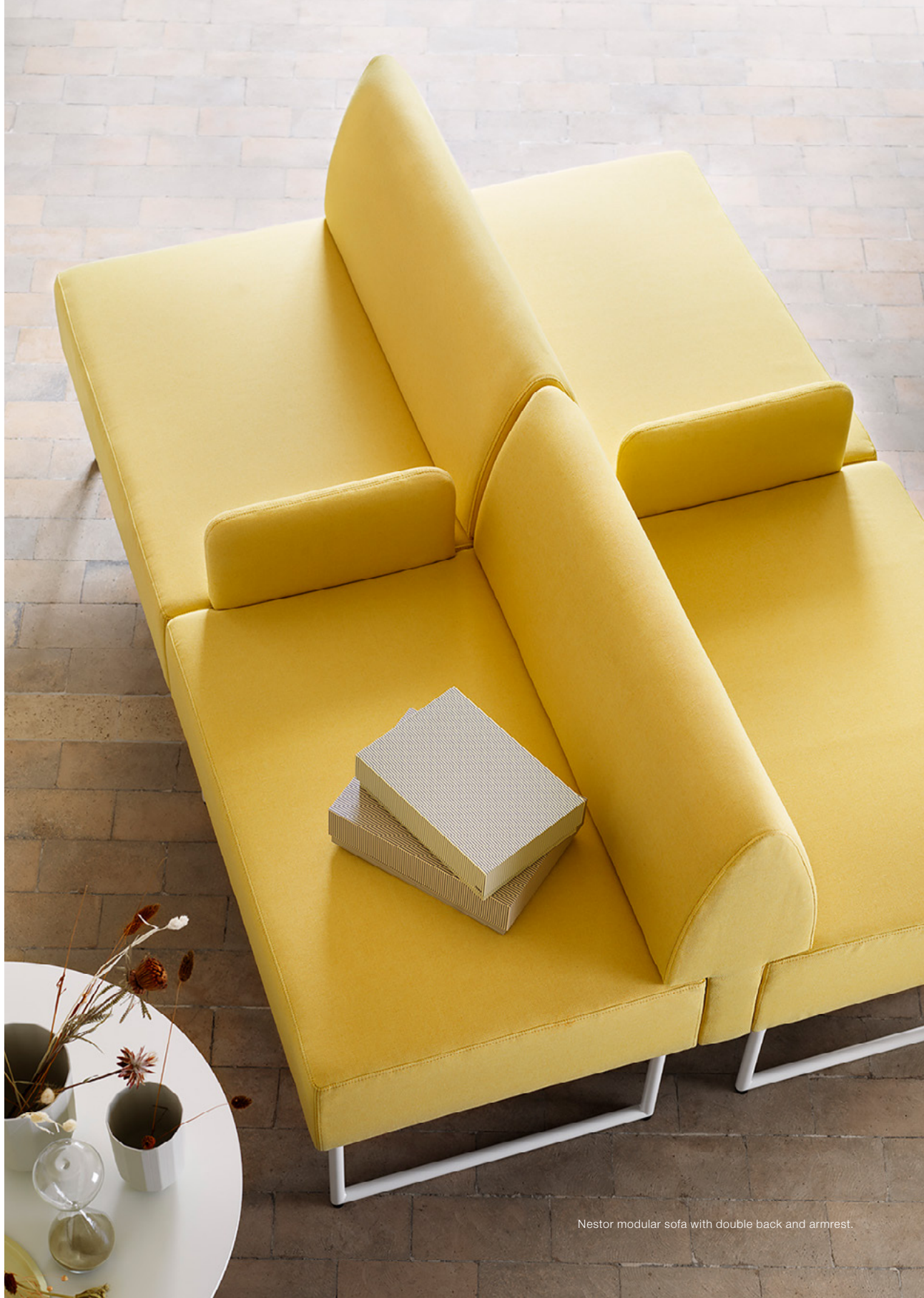
Nestor modular sofa with double back and armrest.