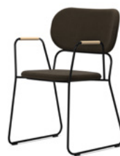
SOFT TOP by Brad Ascalon