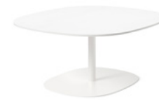
MATSUMOTO by Claesson Koivisto Rune