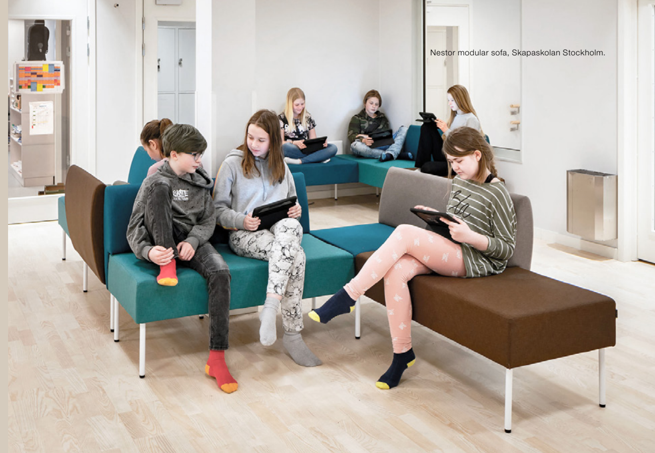
Nestor modular sofa, Skapaskolan Stockholm.

Characteristics and playful furniture for breaks, spontaneous meetings and group work, create the opportunity to use these surfaces as a learning environment.