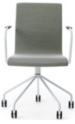
FLEX by Ruud Ekstrand