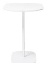
MATSUMOTO by Claesson Koivisto Rune