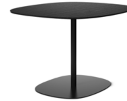
MATSUMOTO by Claesson Koivisto Rune