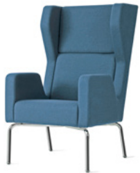
DROPP by Claesson Koivisto Rune