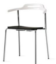
CORE by Mattias Ljunggren