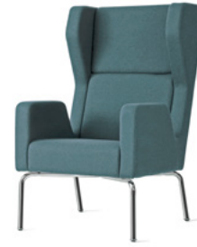
DROPP by Claesson Koivisto Rune