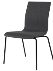
FLEX by Ruud Ekstrand