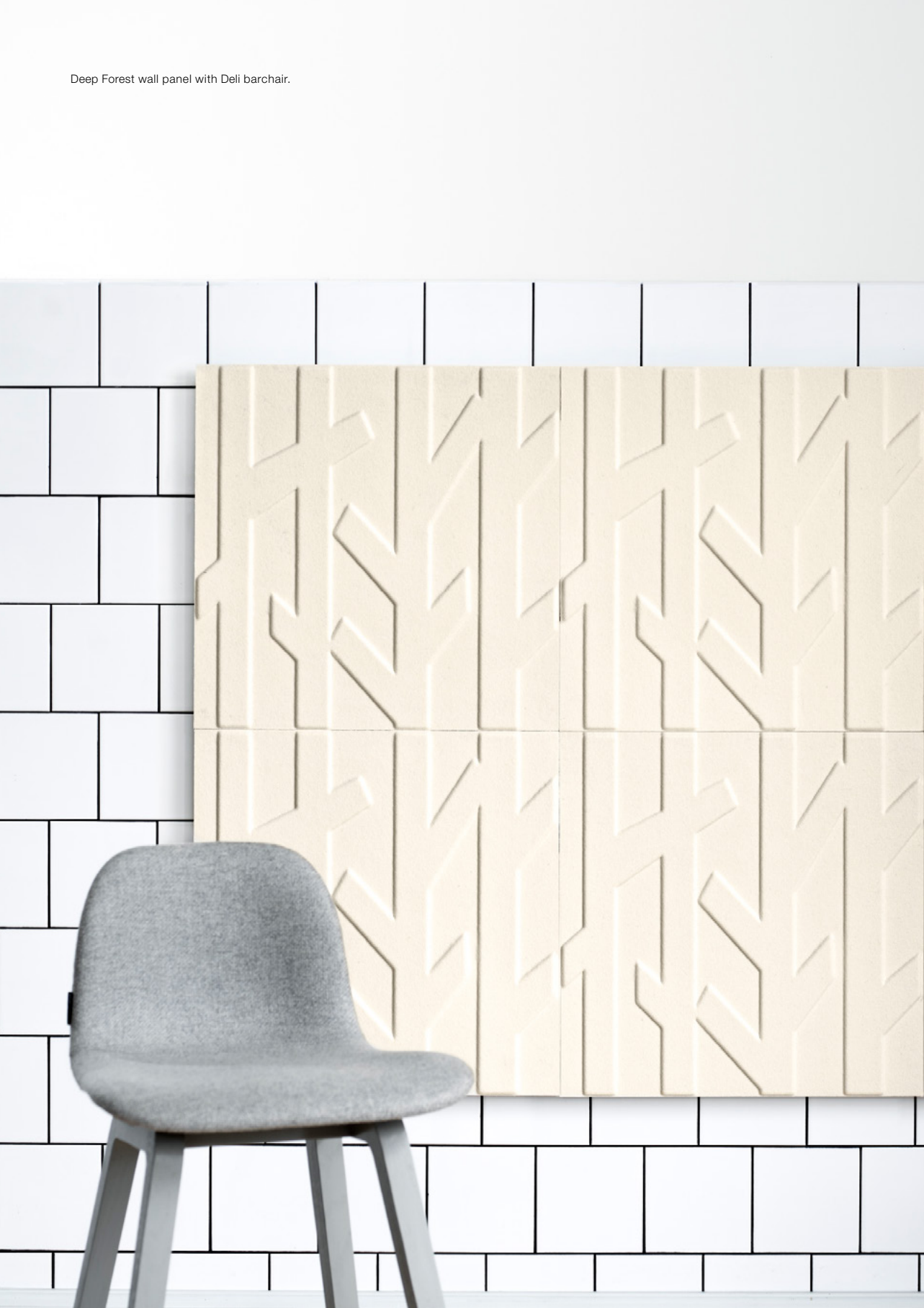
Deep Forest wall panel with Deli barchair.