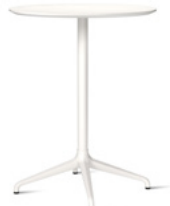
PRIMO