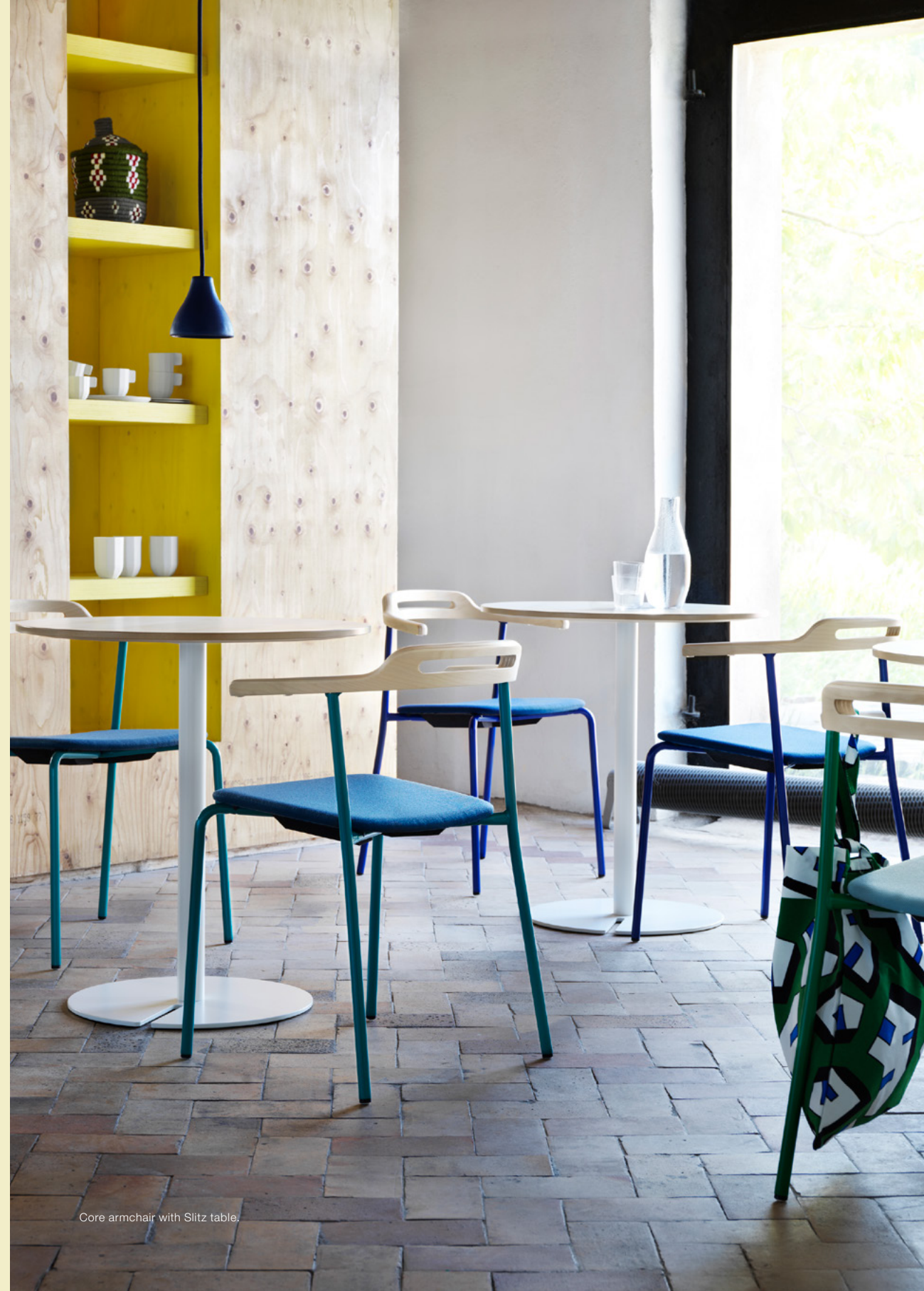
Core armchair with Slitz table.

Furniture and furnishings suitable for flexible canteens that meet the tough demands of good sound level and wear.