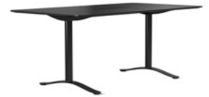
APLOMB by Everything Elevated