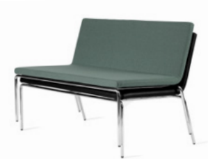
AFTERNOON by Claesson Koivisto Rune