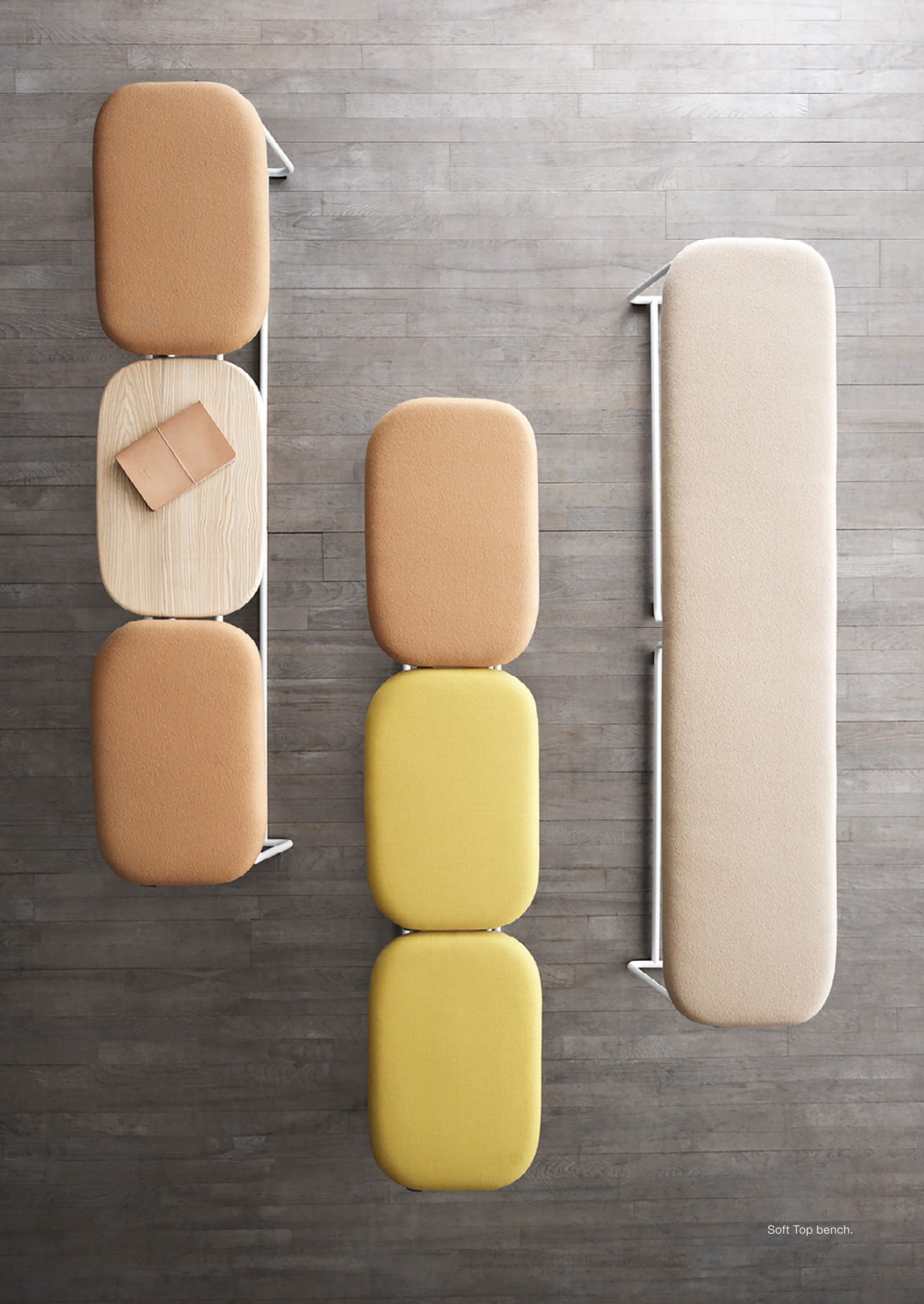
Soft Top bench.