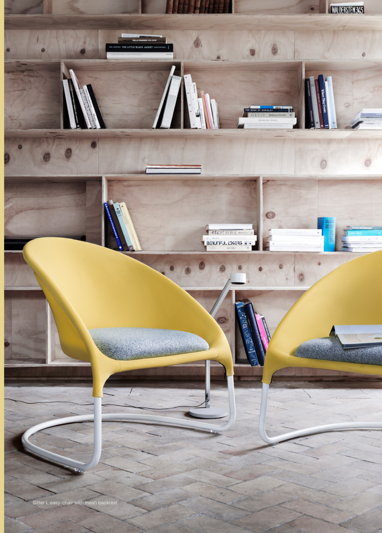
Sitter L easy-chair with mesh backrest.

Seating, tables and flexible module sofas with endless possibilities adapted to study places and group rooms to facilitate learning.