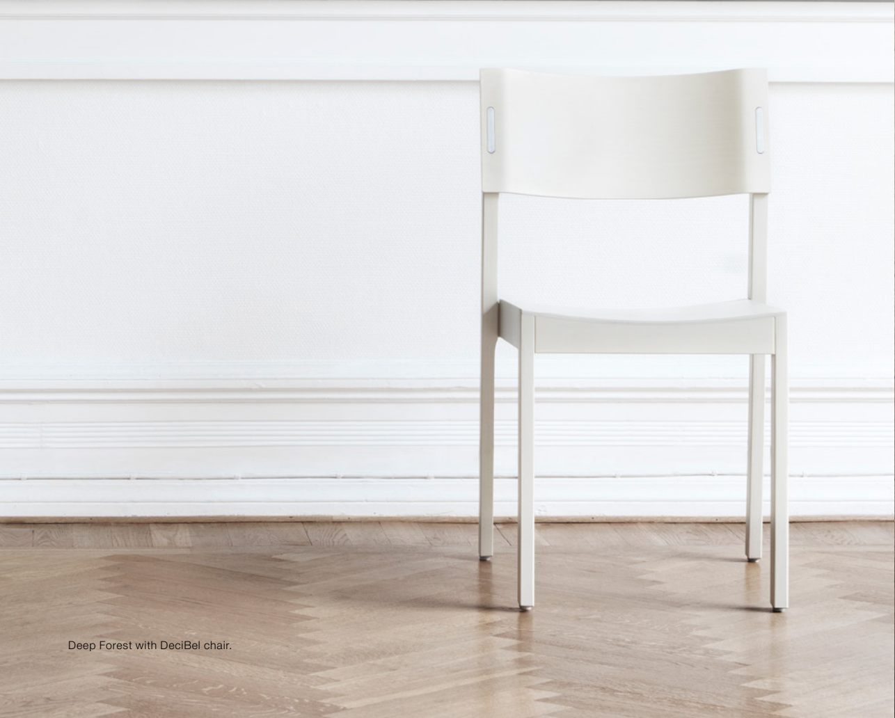
Deep Forest with DeciBel chair.