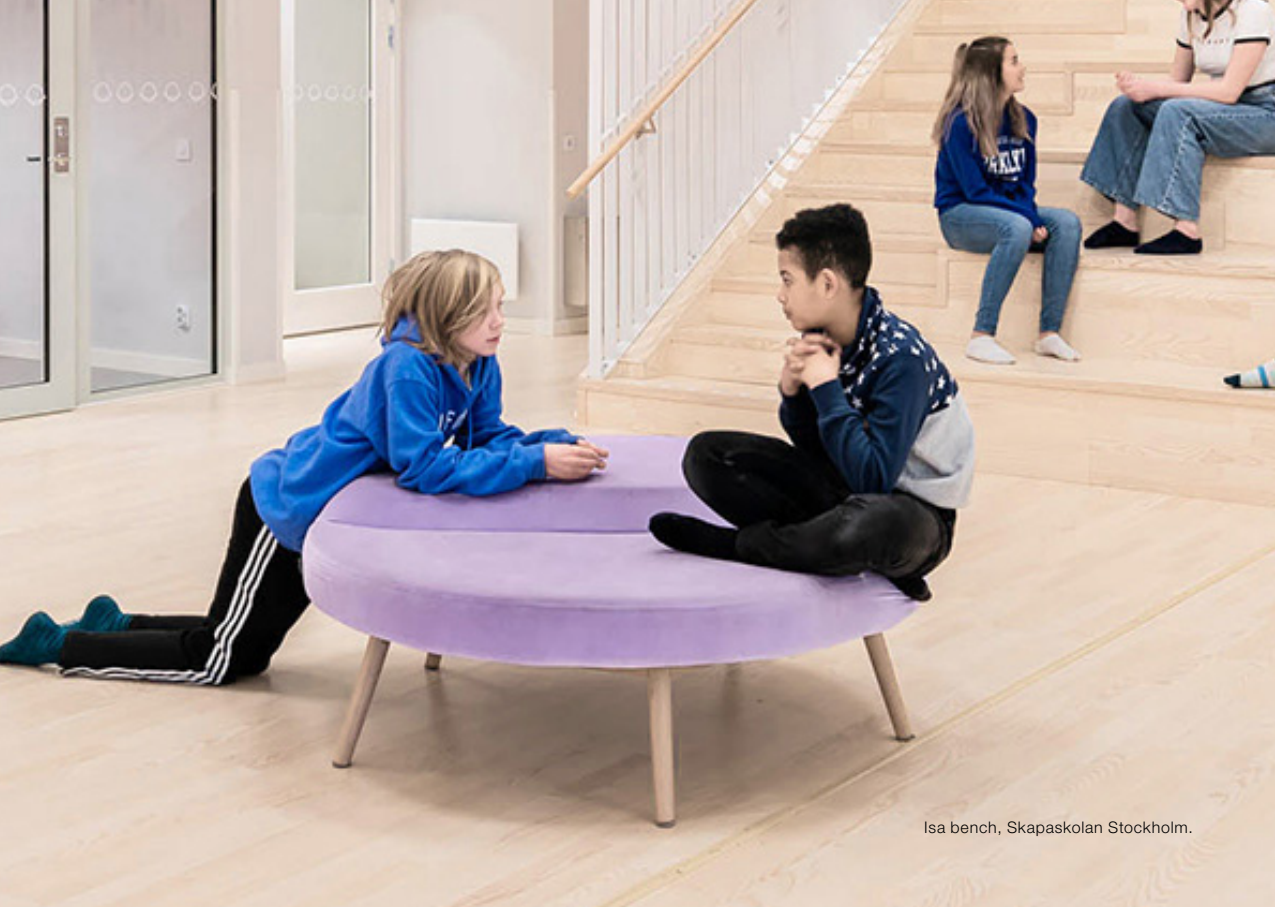
Isa bench, Skapaskolan Stockholm.