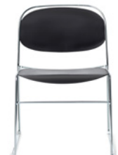
OVAL by Claesson Koivisto Rune