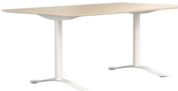
APLOMB by Everything Elevated