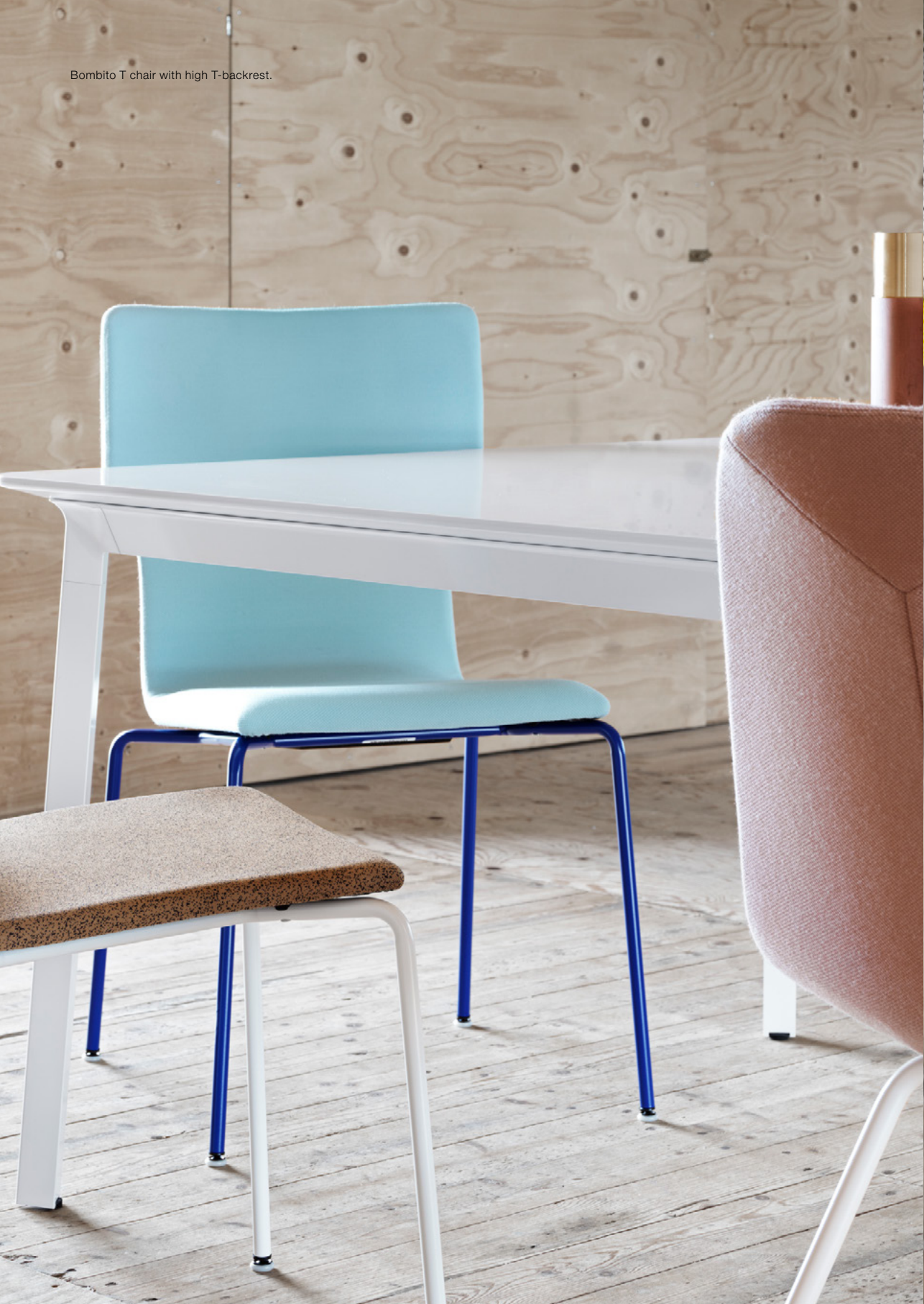
Bombito T chair with high T-backrest.