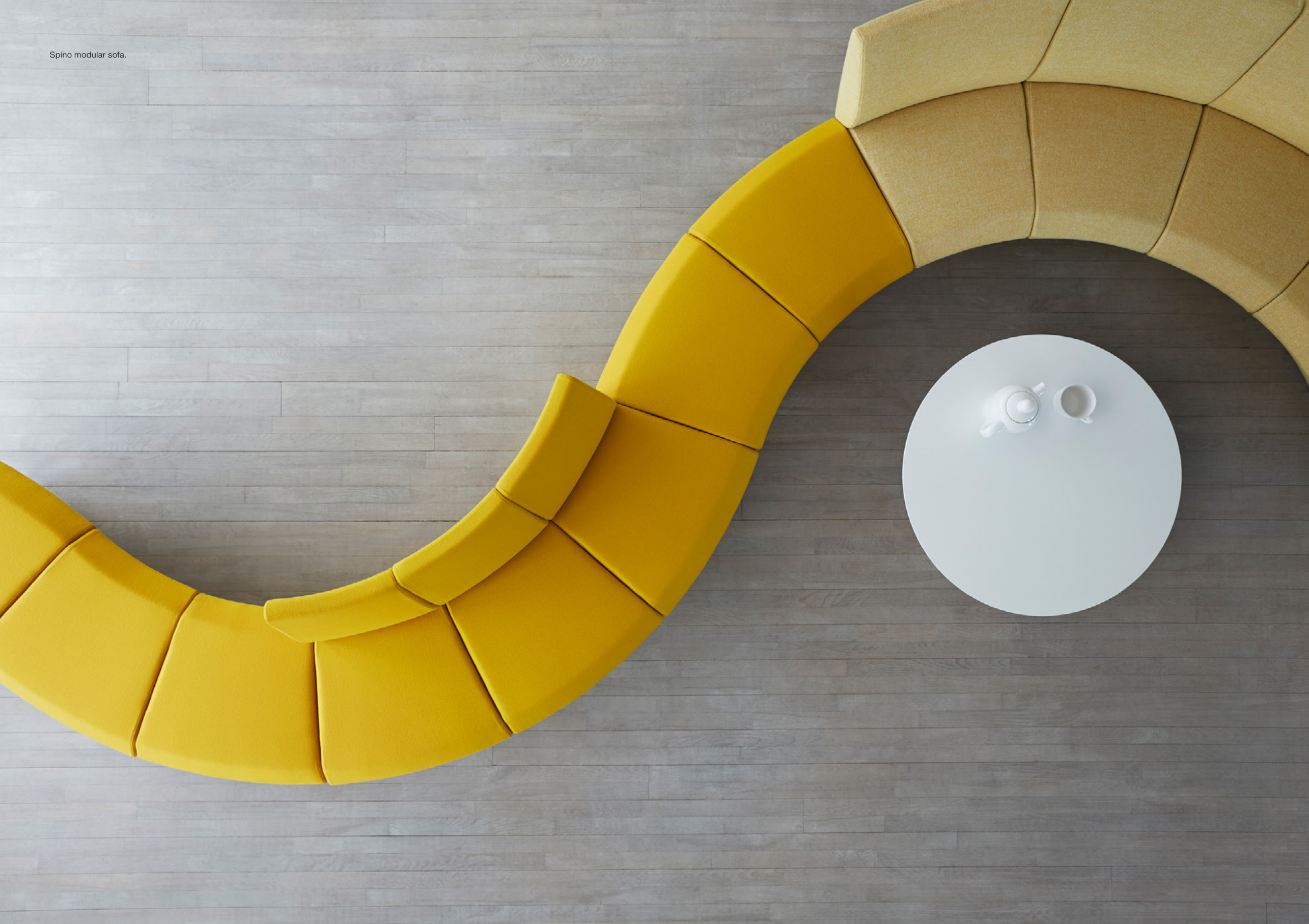
Spino modular sofa.