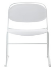
OVAL by Claesson Koivisto Rune