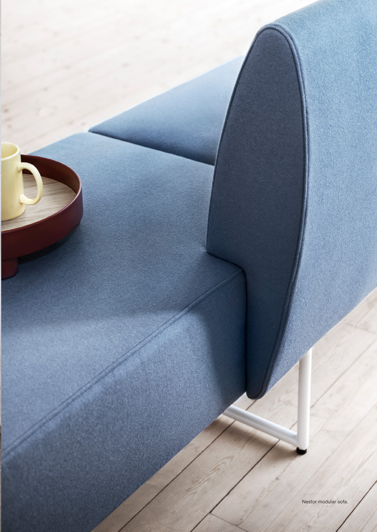
Nestor modular sofa.