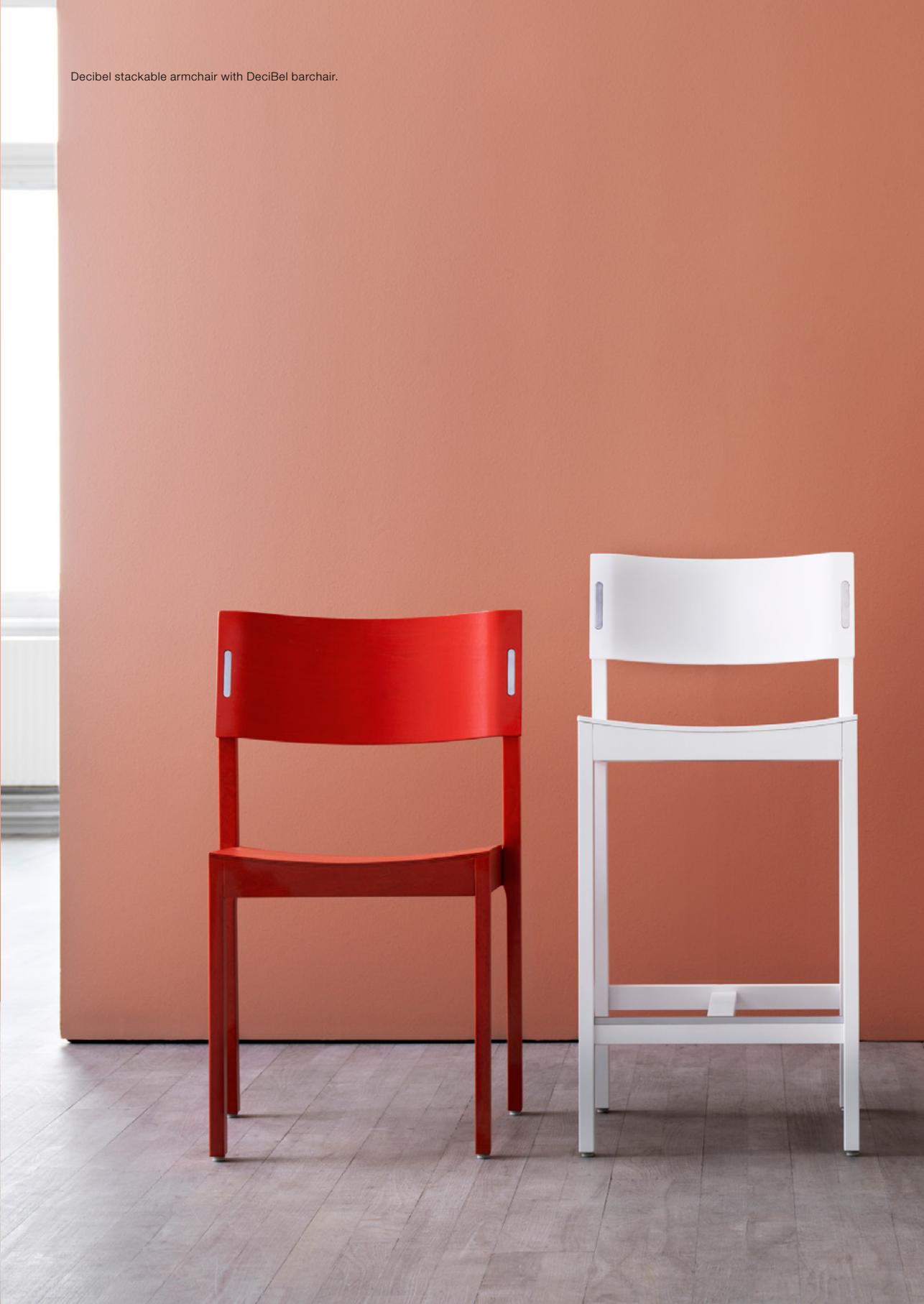
Decibel stackable armchair with DeciBel barchair.